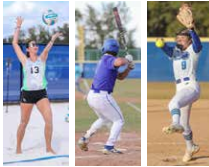
A historic first: For spring and fall seasons, 10 of the 12 teams were nationally ranked for a total of 19 weeks