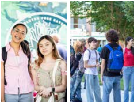
Record Spring 2026 enrollment with over 7,400 students