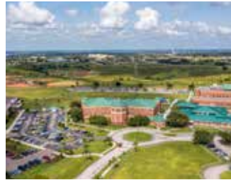
South Lake Campus