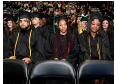
Class of 2026 is the largest graduating class in College history!