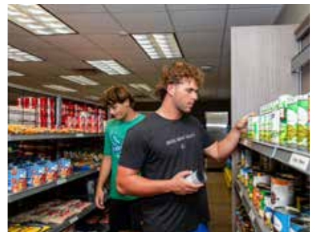
College opens Lakehawks' Harvest Food Pantry to support students