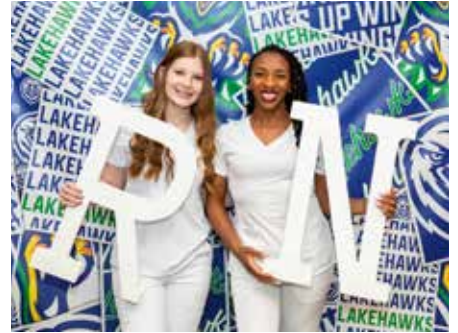
AS Nursing program boasts 97.3% first-time pass rate for the NCLEX