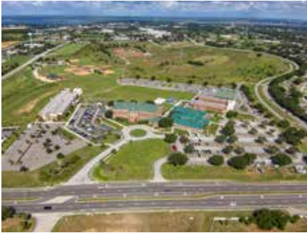
Fastest growing state college in the Florida College System for the second year in a row